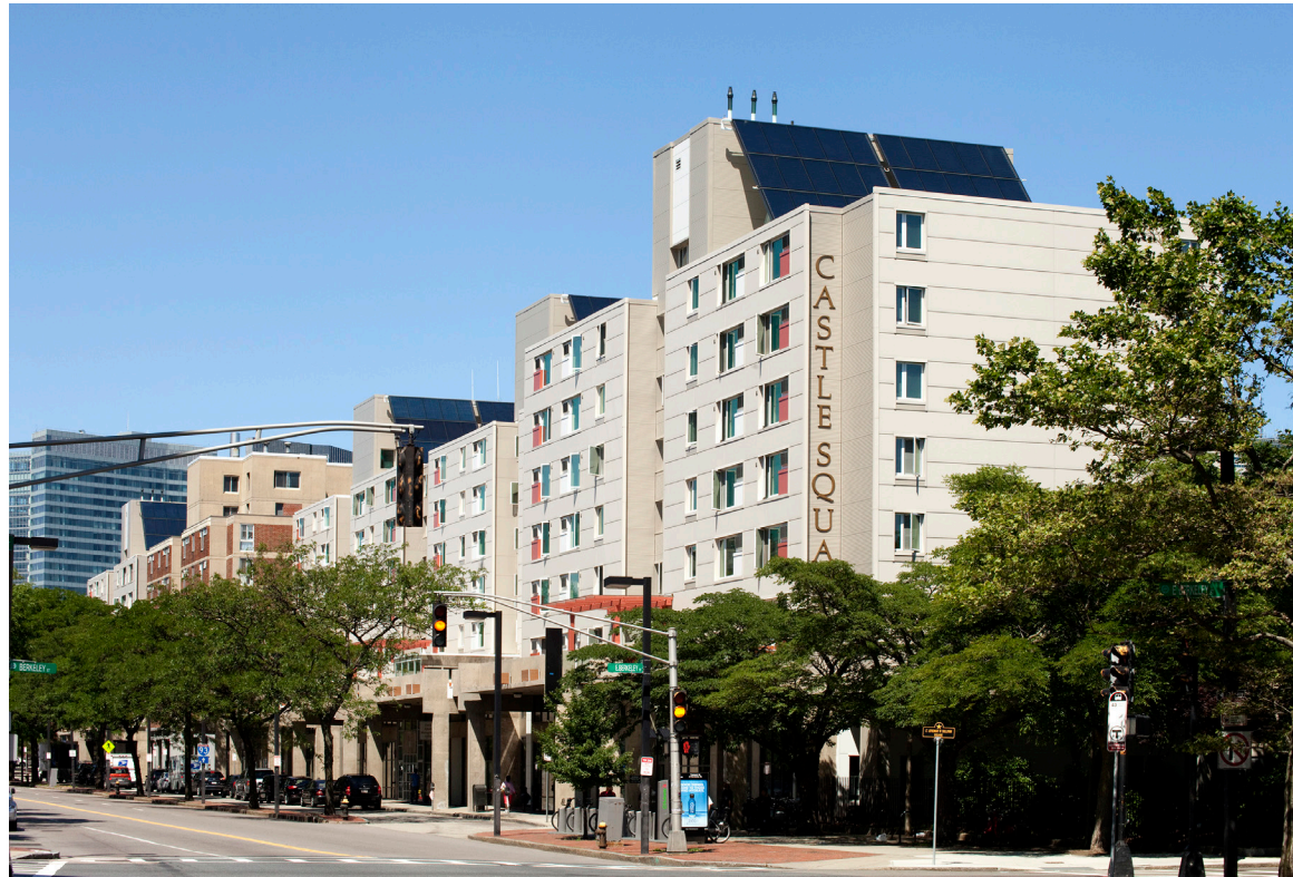
2019 COQ winner, Castle Square

An overview of the COQ program, the national recognition program and the awards' detailed application information and submission materials are available at the NAHMA website at http://www.nahma.org/awards-contests/communities-of-quality/ .