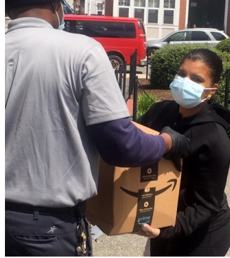
Staff from Beacon Residential communities distribute fresh produce, masks and hand sanitizer to residents.